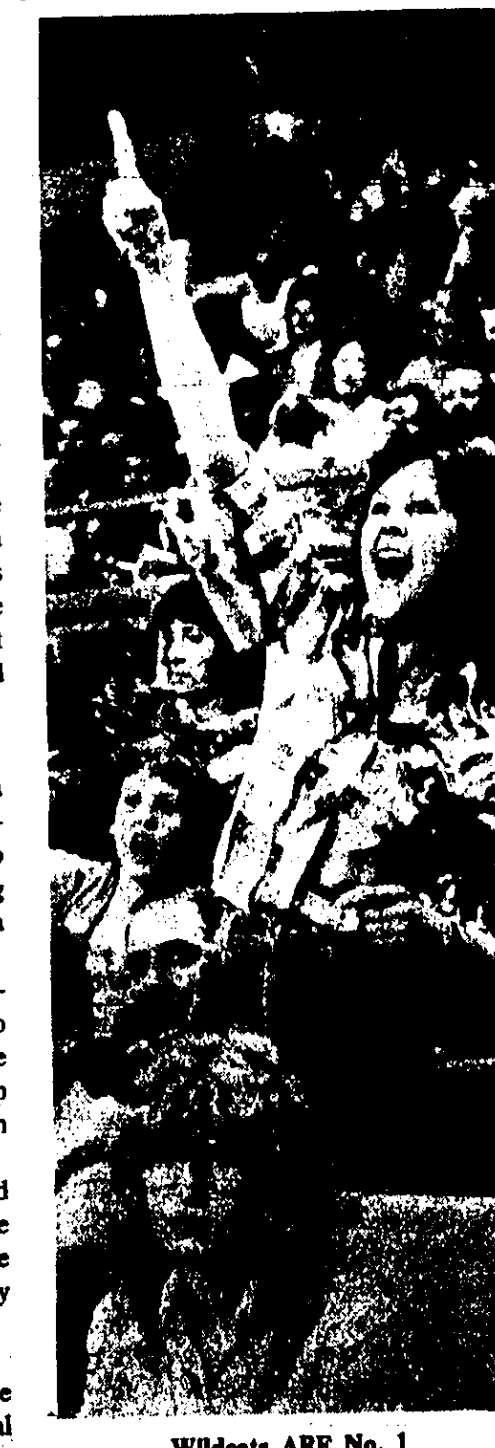
Wildcats ARE No. 1

It was inspiring to see the backing that the state champs got. There were approximately 1,500 Mulvane residents in the stands for the championship game.